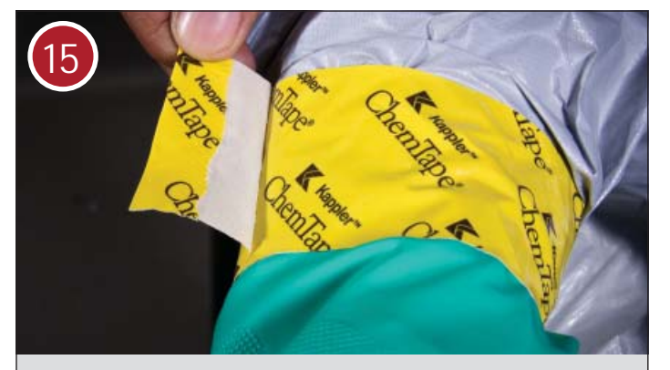
CREATE A TAB ON THE TAPE'S END TO AID IN LATER DOFFING