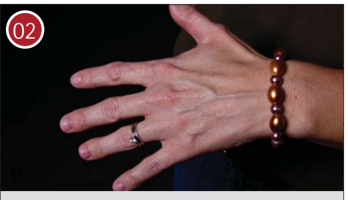
REMOVE ALL JEWELRY AND PERSONAL EFFECTS