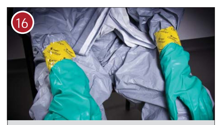
REPEAT TAPING PROCESS FOR OTHER GLOVE