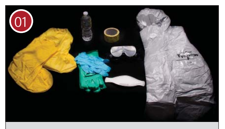
EQUIPMENT : OUTER BOOTS, WATER, OUTER GLOVES, INNER GLOVES, MASK, GOGGLES, SUIT