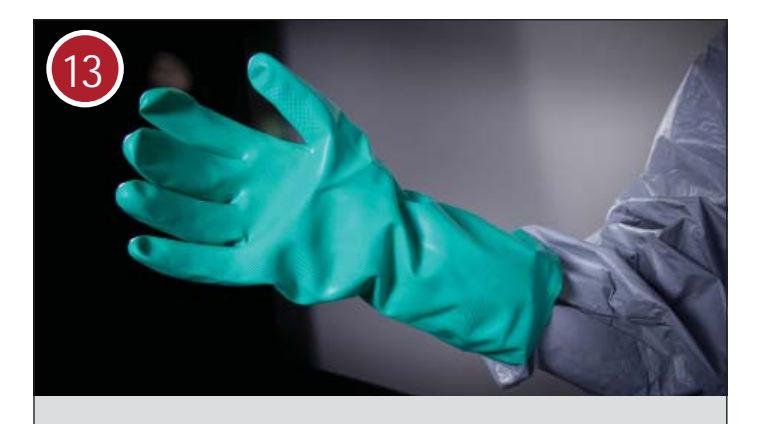
APPLY THE OUTER GLOVES