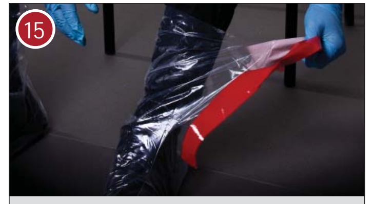
REMOVE TAPE AT TOP OF INNER BOOT LINERS

UNIVERSITY OF NEBRASKA MEDICAL CENTER" HEROES