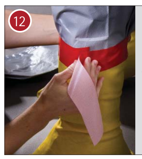
TAPE BOOTS ALONG UPPER RIM SEALING THEM TO THE SUIT

APPLY OUTER RUBBER BOOTS OVER SUIT. THE RUBBER GRIPS SHOULD BE ALONG THE BOTTOM TO IMPROVE TRACTION