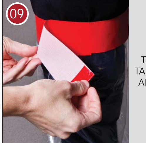
CREATE A TAB ON THE TAPE'S END TO AID IN LATER DOFFING

UNIVERSITY OF NEBRASKA MEDICAL CENTER<sup>®</sup>