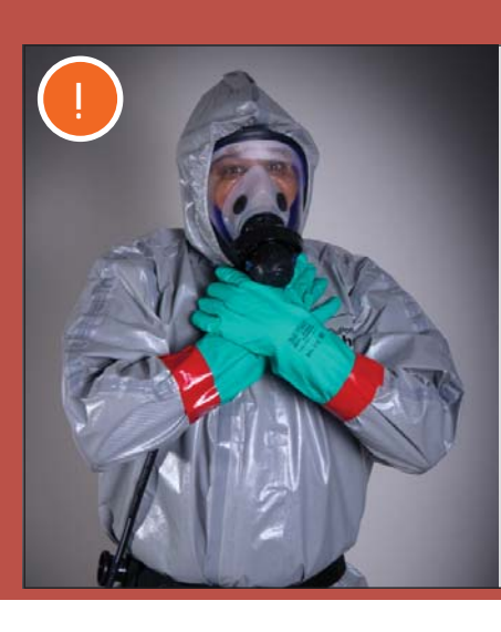
PUTTING HANDS AT THE NECK SIGNIFIES INABILITY TO BREATHE