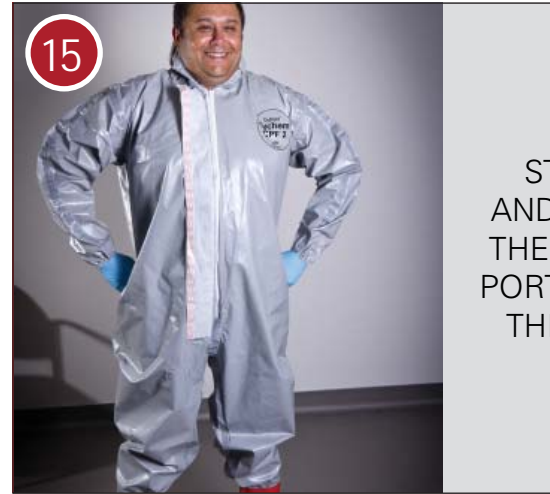
STAND AND APPLY THE UPPER PORTION OF THE SUIT

UNIVERSITY OF NEBRASKA MEDICAL CENTER" HEROES