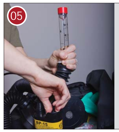
TEMPORARILY ATTACH BATTERY AND TEST PAPR MOTOR USING AIR FLOW METER