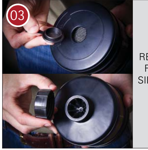
REMOVE CAPS FROM BOTH SIDE OF FILTER

UNIVERSITY OF NEBRASKA MEDICAL CENTER" HEROES