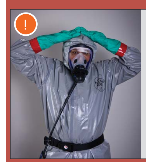
PATTING THE HEAD INDICATES NEEDING OUT OF THE SUIT

THE SUPPORT TEAM SHOULD BE AWARE OF HAND SIGNALS USED WHILE IN THE SUIT