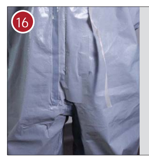
REMOVE AND SEAL THE LOWER PORTION OF THE ZIPPER TAPE