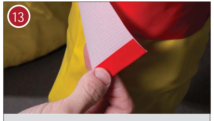
CREATE A TAB ON THE TAPE'S END TO AID IN LATER DOFFING