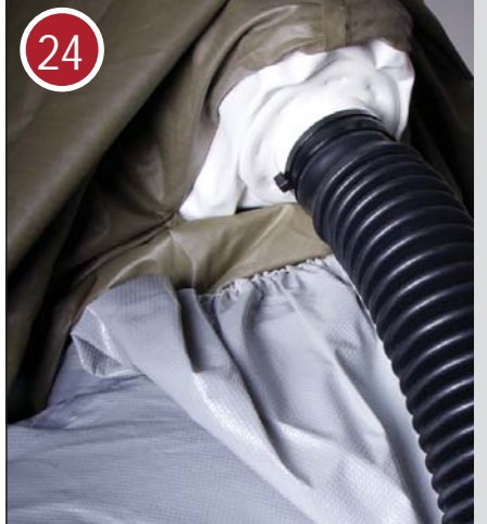
TUCK THE INNER SHROUD INTO THE SUIT'S NECK