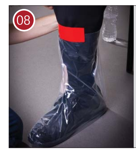
APPLY BOOT LINERS TO BOTH FEET AND TAPE TO OUTER SURFACE OF PANTS

UNIVERSITY OF NEBRASKA MEDICAL CENTER<sup>®</sup>