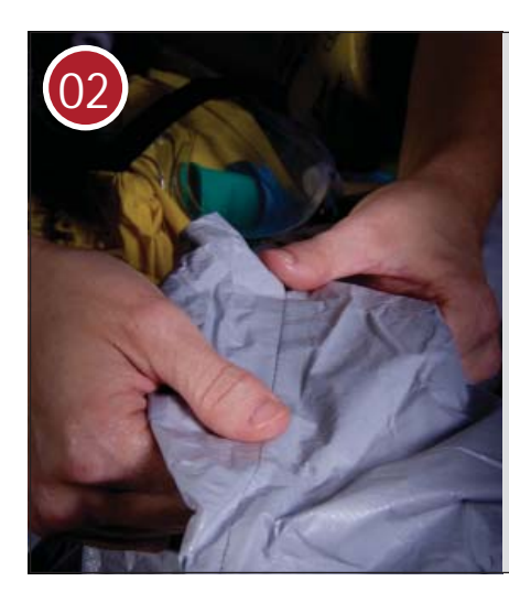
CAREFULLY INSPECT THE SEAMS OF THE SUIT FOR TEARS OR BROKEN SEALS

EQUIPMENT : PAPR AND HOOD, BATTERIES, FILTERS, DUCT TAPE, SUIT, INNER BOOTS, OUTER BOOTS, INNER GLOVES, OUTER GLOVES