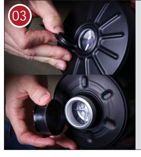
REMOVE CAPS FROM BOTH SIDES OF FILTER