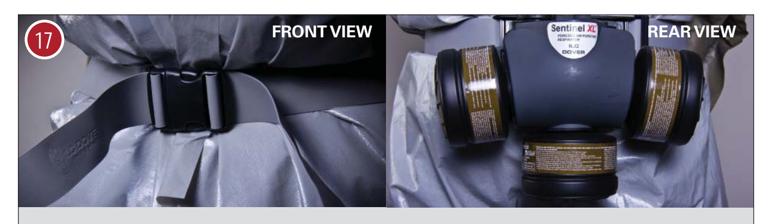
APPLY PAPR MOTOR AND BELT

REMOVE AND SEAL THE LOWER PORTION OF THE ZIPPER TAPE