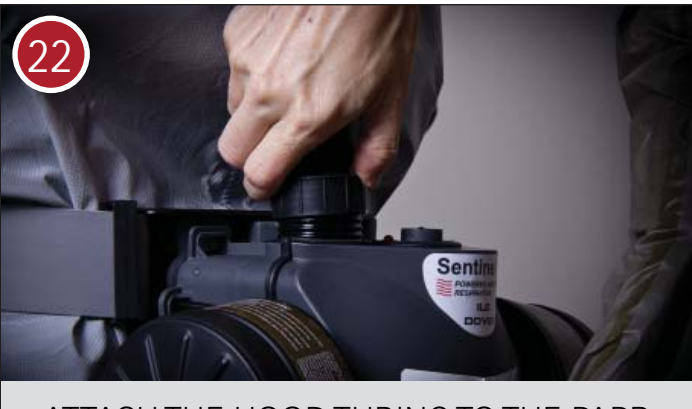
ATTACH THE HOOD TUBING TO THE PAPR MOTOR