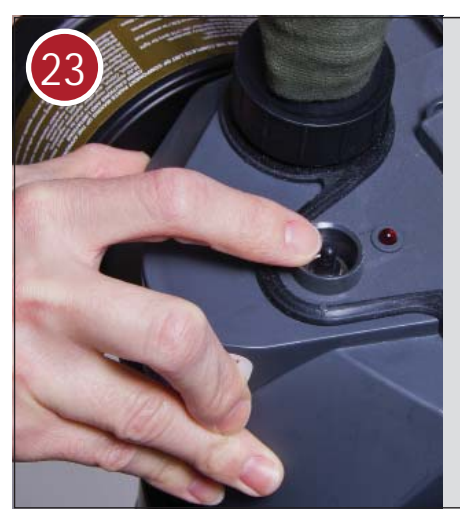
TURN ON THE MOTOR AND PUT THE HOOD ON