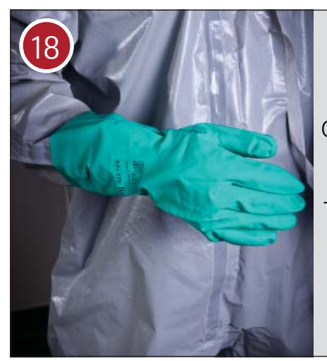
APPLY THE OUTER GLOVES.

CAREFULLY TUCK THE CUFF OF THE SUIT INSIDE