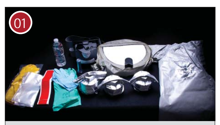
EQUIPMENT : PAPR AND HOOD, BATTERIES, FILTERS, DUCT TAPE, SUIT, INNER BOOTS, OUTER BOOTS, INNER GLOVES, OUTER GLOVES