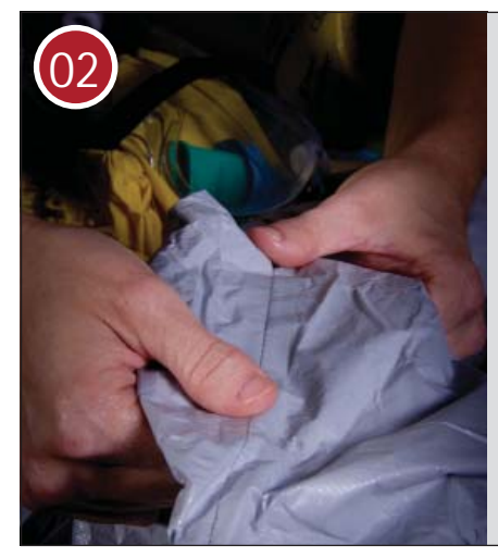
CAREFULLY INSPECT THE SEAMS OF THE SUIT FOR TEARS OR BROKEN SEALS