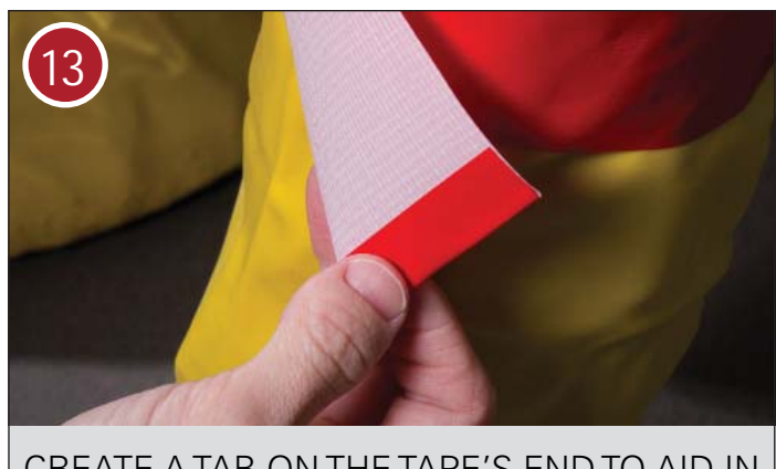
CREATE A TAB ON THE TAPE'S END TO AID IN LATER DOFFING