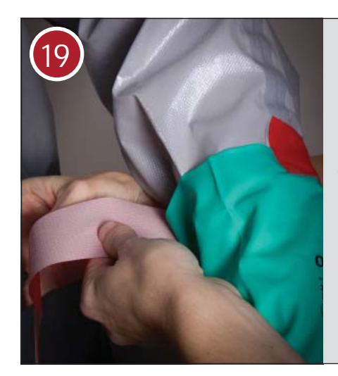
TAPE GLOVE ALONG UPPER RIM SEALING THE GLOVE TO THE SUIT

CAREFULLY TUCK THE CUFF OF THE SUIT INSIDE