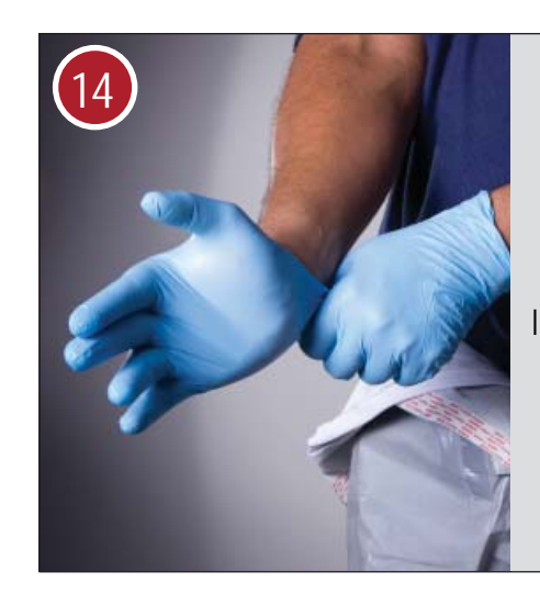
APPLY THE INNER GLOVES