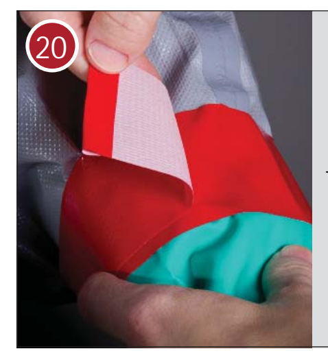
CREATE A TAB ON THE TAPE'S END TO AID IN LATER DOFFING